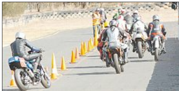
The Period 5 Unlimited class head from the pits on to the track yesterday.